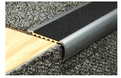
STC7635 suited for carpet