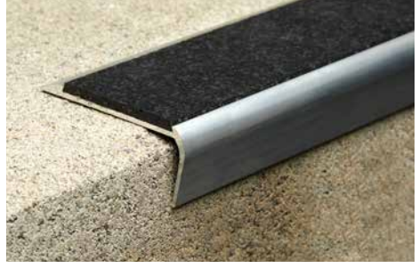
STU5825 suited where there is no floor coverings