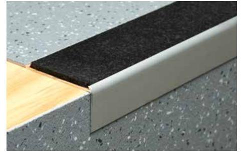
STV5028 suited where there is vinyl floor coverings