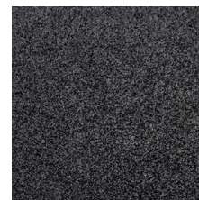
Bross Iron - 552