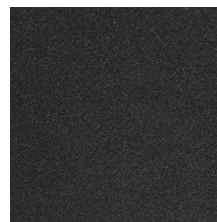
Bross Smokey Grey - 638