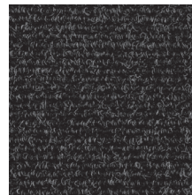
ScrapeRIB Charcoal - 443