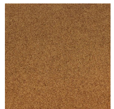
Bross Twine - 338