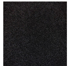
Bross Black - 345