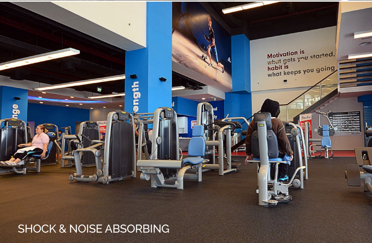
SHOCK & NOISE ABSORBING

The environmentally friendly Express Delivery Neoflex™ range of rubber flooring is designed to withstand the rigors of heavy commercial indoor and outdoor flooring applications.